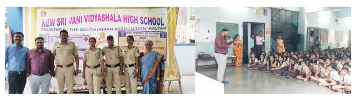
31. MISSION PINK HEALTH: Aao School Chalein (Thursday 4th March 2020)

HEALTH EDUCATION PROGRAM was conducted on 4th March 2020 between 3.00 to 5.00 pm IMA Dombivli Under MPH Along with Mahatma Phule Police Station, Kalyan West at SRI VANIVIDYASHALA HIGHSCHOOL, Kalyan West. Awareness Lecture on " Sex Education, Good Touch, Bad Touch & Child Abuse was delivered by expert psychiatrist. A session on Reproductive health and Changes during adolescence for boys and session on Reproductive health, nutrition and hygiene for girls was taken by experts from IMA Dombivli. About 300 students were benefited.